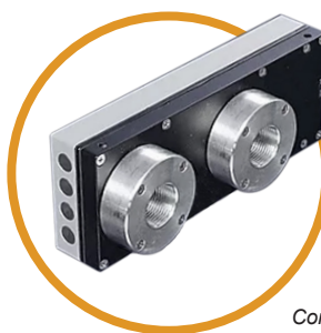
Compatible with the BCVILP16 model