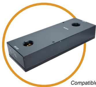
Compatible with BCVIP4 models and BCVIP8