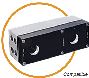
Compatible with the BCVIP12 model